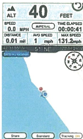
Figure 1.0 – GPS Altimeter reading at southwest property corner – 40’ elevation

Specifically, I have in my possession an altimeter, which measures altitude above sea level. The Altimeter readings at relevant property corners are as follows: